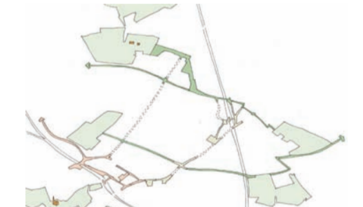
D Tie green spaces into the Intensification Area with green routes