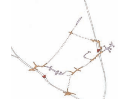
F Improve transport and movement network to accommodate intensification