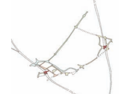
E Improve permeability and quality with new public realm