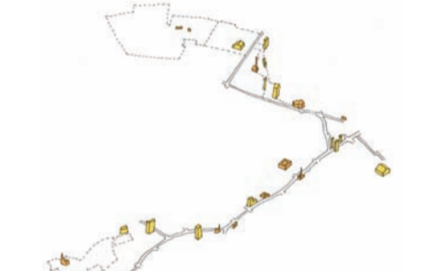
C Add to existing string of landmark buildings to aid orientation